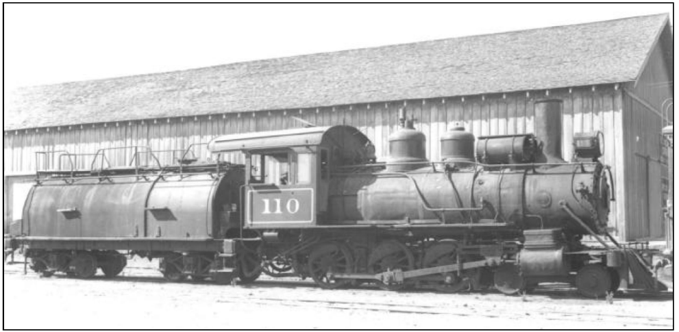
Figure 3, above: PCRy #110, is seen here at San Luis Obispo in October 1940. The whaleback tender was common to both of the 4-6-0s.

Figure 5 shows consolidation number 15, formerly of the Columbia and Puget Sound whose name changed to Pacific Coast Railroad in 1916. I had not seen this photograph published and had to include this Alco-Brooks locomotive built in 1907 as a comparison with the San Luis Obispo cousins numbered 105 though 109.