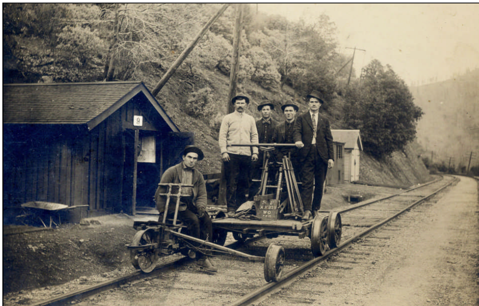
An unknown photographer made this carefully posed image somewhere on the Southern Pacific. Could it be Cuesta siding on the north side of the summit?

And a side note: The story of Sheffield velocipede development that the Museum has been providing may be more folklore than fact. The Autumn 1972 bulletin of the Railway & Locomotive Historical Society, recently brought to light in the Museum