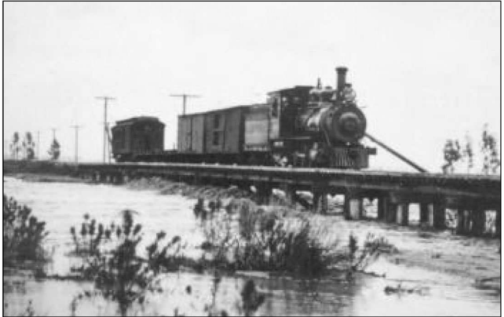
Figure 1: Mixed Pacific Coast Railway train with consolidation crossing the Santa Maria River. Photo was probably taken prior to World War I from the old Highway 101 bridge facing southwest toward Santa Maria.

The compact and relatively heavy weight 4-6-0's were the last locomotives bought by the company. They