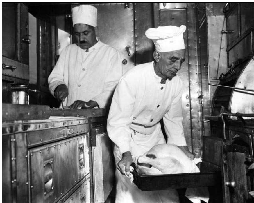
Southern Pacific Railroad dining car kitchen.