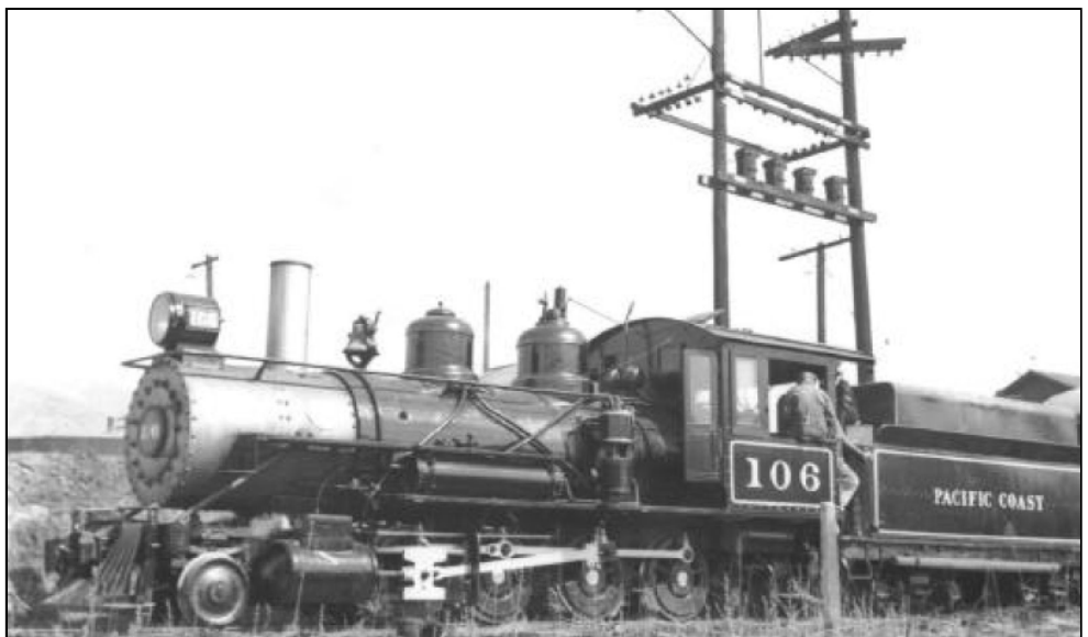
Figure 2, below: Consolidation 106. Smoke stack, air tanks, cab and headlight have been modified from the as-built condition and the electric generator added. The 106 still has the extended smoke box as delivered. San Luis Obispo, 1937.

came from the Nevada-California-Oregon (NCO) in May 1928. Heavier than the 2-8-0's numbers, their primary use was in hauling heavy gravel trains from the Sisquoc quarries. Their extra 8 tons of weight when added to the increase in driver diameter from 36" to 44" converted to greater speed rather than extra tractive effort. The 110 and 111 were built in 1910 and 1911 and were identical except for their crossheads and valve gear. These differences can be seen when comparing Figures #3 and #4.